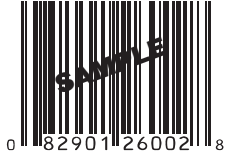
Sample 12-Digit UPC Code

Original submissions only (Do not mail to this address after July 31, 2008)