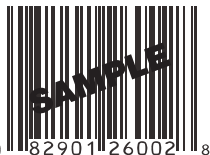
Sample 12-Digit UPC Code

Original UPC barcode must be included for these products.