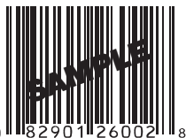
Sample 12-Digit UPC Code

Original UPC barcode must be included for these products.