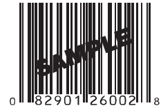
Sample 12-Digit UPC Code

If you have any questions about rebate submissions, please call 1-800-477-4137. Please allow 8 weeks for processing