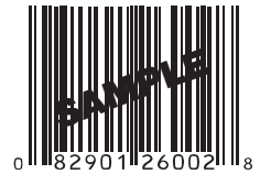
Sample 12-Digit UPC Code

If you have any questions about savings submissions, please call 1-800-477-4137. Please allow 8 weeks for processing.